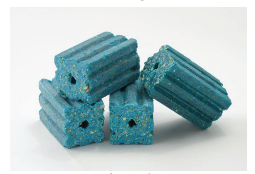
Picture not representative of Bait Placement. Bait stations are mandatory for outdoor, above ground use.