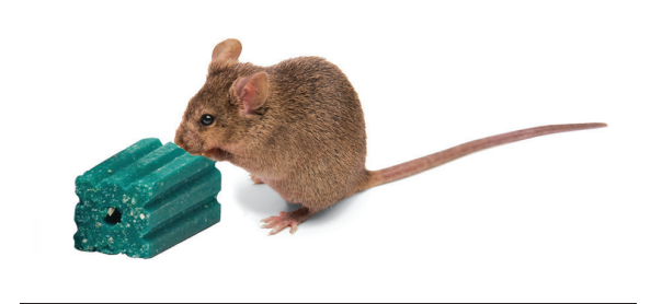
Picture not representative of Bait Placement. Bait stations are mandatory for outdoor, above ground use.